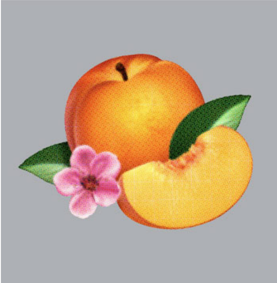
Bankrupt! drops on April 23.

For more information, visit Phoenix’s official website .